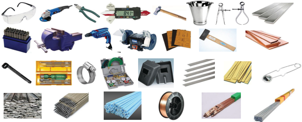
Other Welding Accessories.

All tools & tacksels required to run the welding workshop will be provided. White Googles, Hand Grinder with Grinding Wheels, Cutting Plier, Digital Welding Gauge, Ball Peen Hammers, SS Water Buckets, Inside & Outside Calipers, Number punch set, 8" Bench vice with stand, Portable Drilling Machine, Pedestal Grinding Machine with wheels, Emery Paper, Gas Cylinder Key, Screw Driver set, Hose clamps, Welder Kit, Welding Helmet, Spark Lighter, Brass flat strips, Aluminum flat strips, Copper flat strips, SS flats strip, MS flat strips, MS welding rods, Flux coated Brass rods, MIG wire spools, Silver Brazing Rods, MS & TIG welding rods.